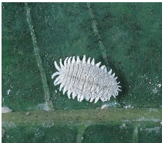
Plate 7: Citrus mealybug adult

release is made early in the season, followed by smaller 'top-up' releases at intervals of 3–6 weeks. This is known as the 'dribble release' technique. In orchard environments, cryptolaemus should be released when active mealybugs are present.