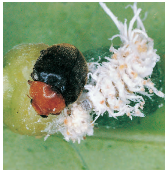
Plate 4: Cryptolaemus larva and adult beetle feeding on mealybug egg mass

The adult beetle is about 4 mm long, oval in shape with an orange head and black wing covers. Cryptolaemus larvae grow to 13 mm long