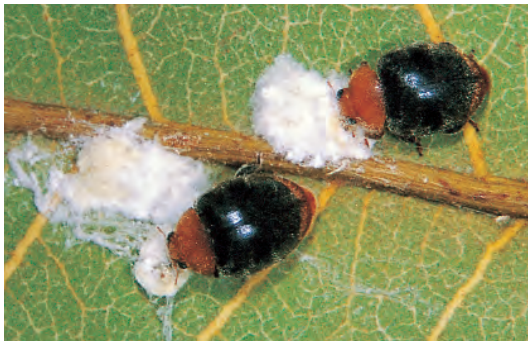
Plate 6: Cryptolaemus adult beetles feeding on eggs of pulvinaria scale