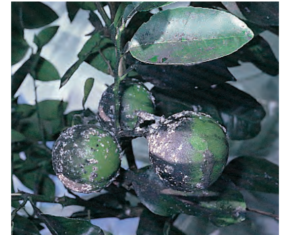
Plate 8: Mealybug-infested fruit with sooty mould

Pesticide residues may slow or prevent the establishment of cryptolaemus . Copper and nutritional sprays will usually not harm cryptolaemus , and some miticides are also quite safe. Organophosphate, carbamate and synthetic pyrethroid insecticides are very toxic and should be avoided where possible. If these sprays are applied, a minimum of 4 weeks should elapse before cryptolaemus is released.