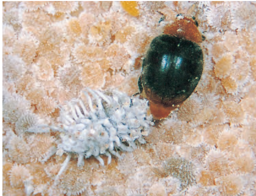
Plate 5: Cryptolaemus adult and larva feeding on citrus mealybugs. The younger larvae can easily be confused with the mealybugs on which they feed. Older larvae, however (as shown), are larger than mealybugs.