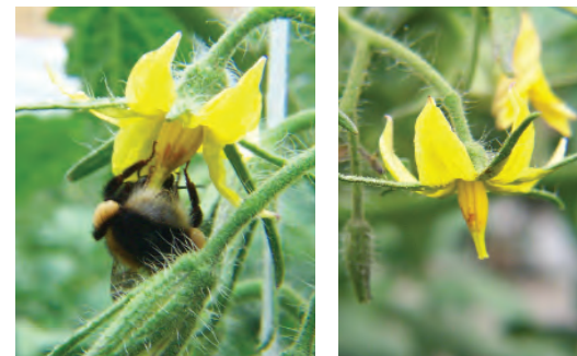
Plate 88: Bumblebee pollinating a tomato flower (left) and the brown bruise mark left from a bee's visit (right). Note the pollen sacs on the bee's legs.

During visits to flowers, bumblebees cause vibrations which are necessary for the optimum pollination of crops such as tomatoes and eggplant. Provided the plant produces living pollen, bumblebees can completely replace manual pollination and the use of hormones. The advantages of this type of pollination are