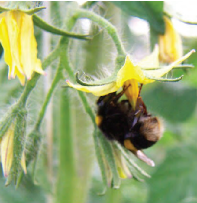
Plate 87: Bombus terrestris

The most commonly used bumblebee species is Bombus terrestris , but B. occidentalis , B. impatiens and B. canariensis are also used where appropriate.