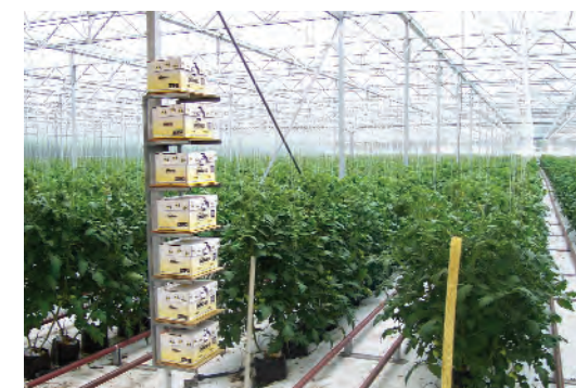
Plate 89: Bumblebee hives in position

If you are stung the result is usually temporarily painful, like pricking a finger with a needle. This usually fades after a few minutes. The pain can be relieved if necessary with an ice